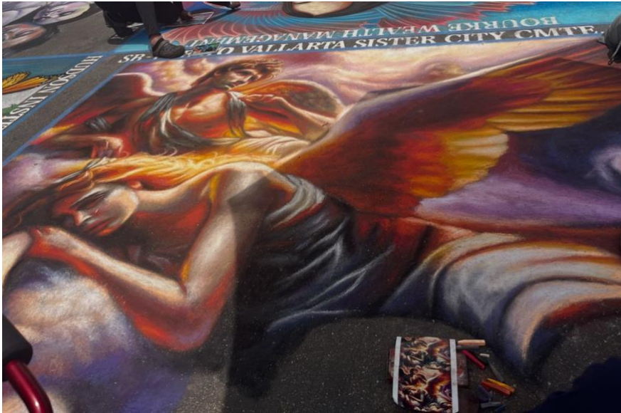
Rafa's completed work