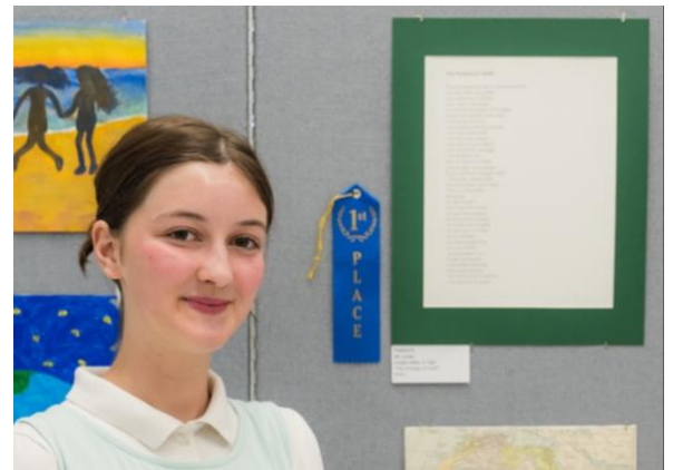
First Place Winner – Poetry Orchard of Youth