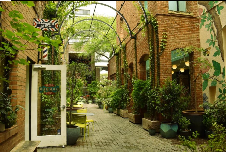
Photography - Green Spaces Celeste Jenkins-O'Reilly, Fort Worth Sister Cities International

These are winners from last year's Showcase: Climatescape: Cities of the Future