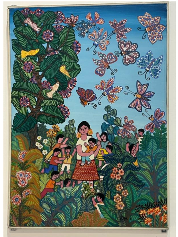
My personal favorite