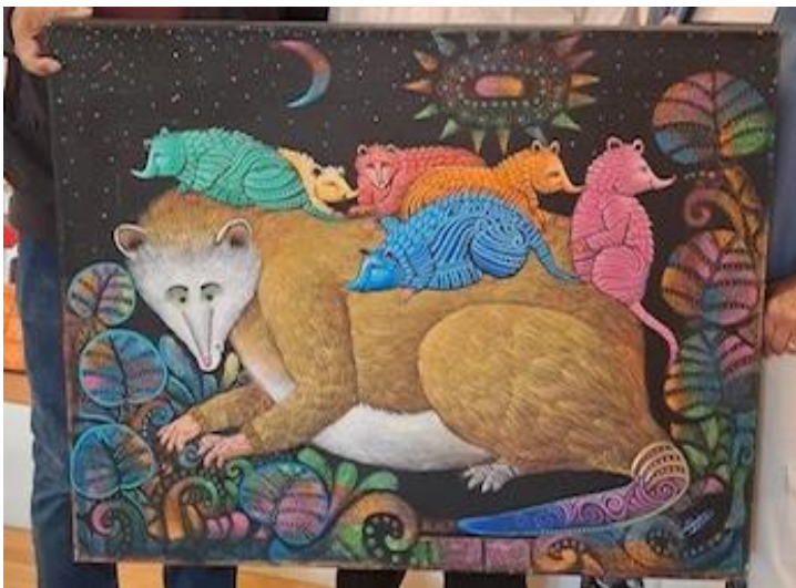
A very popular motif!!