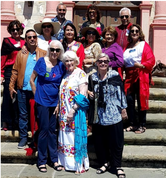
Misa del Presidente – at Mission Santa Barbara