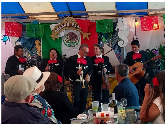
Mariachi Fiesta Alegre Mexicana

The patio was festive and the mood was infectious. The shrimp ceviche appetizer was a hit. Of the three meal choices by far the favorite was sea bass 'al mojo de ajo'. All the entrees were tasty and the meals brought hot to the table. Many thanks to the excellent staff!!!