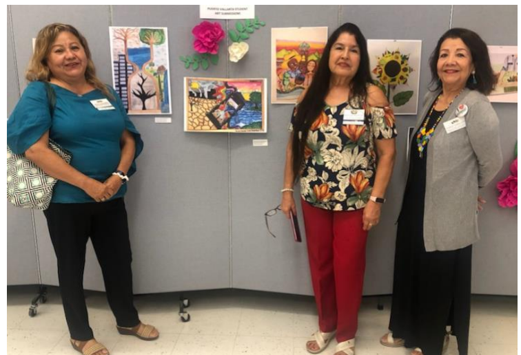
PV visitors with PV artwork