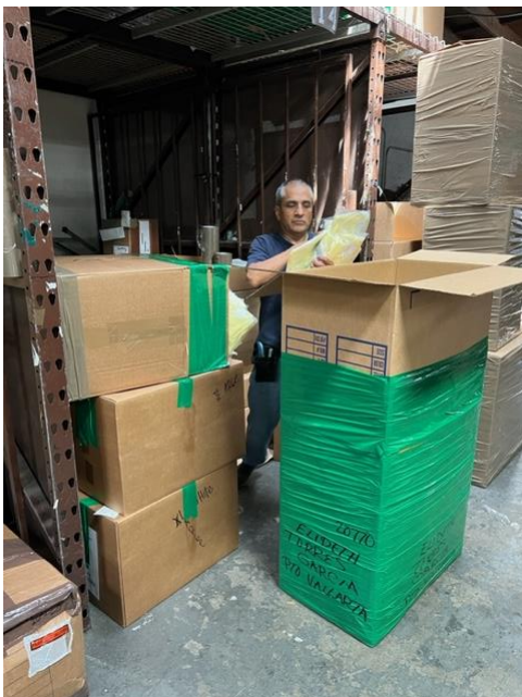
Packaging medical gowns LA for destination SB Rehab Clinic in Puerto Vallarta

As you can see the size of the boxes in first photo then in second photo all the contents were compressed into one box. The Rehab Clinic will receive these and thanks to the Santa Barbara Rotary North cooperative funding with SB/PV the Clinic now has a place to store supplies like this.