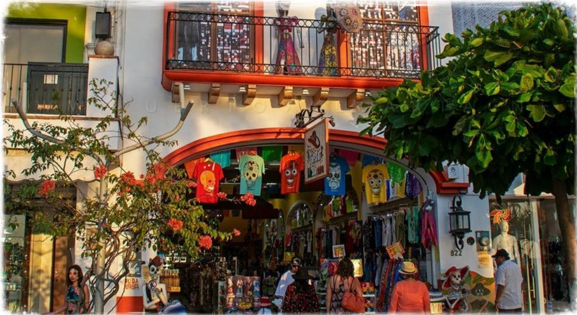
Street scene of shopping in Puerto Vallarta

This photo and information on happenings in Puerto Vallarta are provided by Corina Guizar of PuertoVallarta.net . Our blog is updated based with the news and what is happening in Puerto Vallarta, so check it out: information@puertovallarta.net .