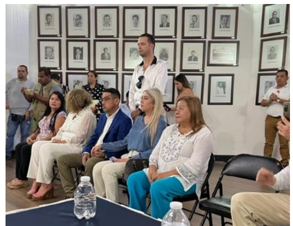
Some familiar faces from our Sister Club in PV.