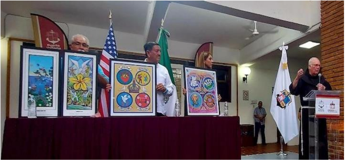
Presentation at City Hall in Puerto Vallarta.