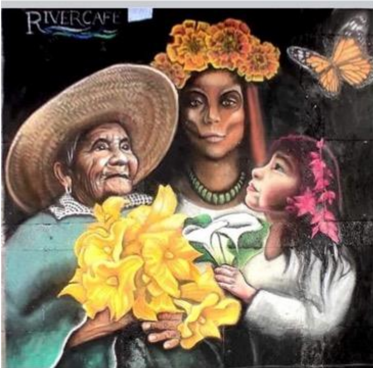
Pintura de Renatta Arias primer lugar