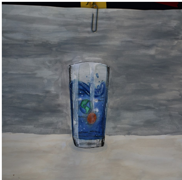
2nd Place Winner Chloe Copelland ($150)