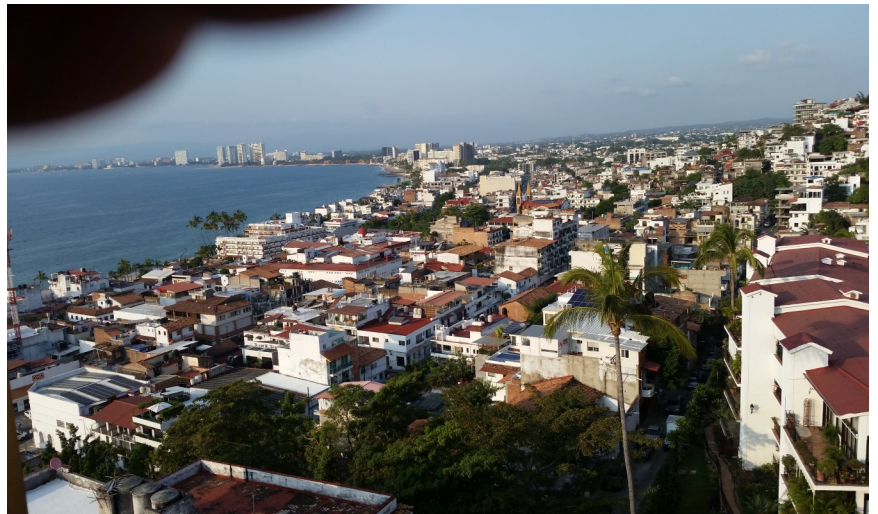
A group of 21 members returned to Puerto Vallarta in 2021