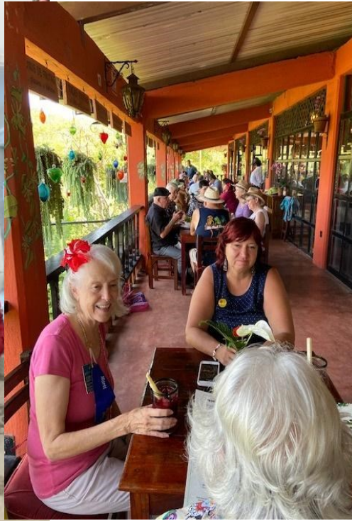
Lunch Time at Jardín Botánico