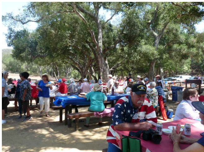
Members of our group and Veterans Group at 4th of July Picnic