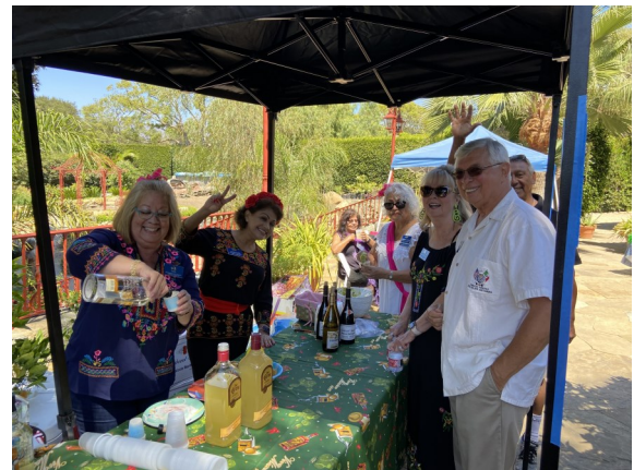
Alma served and tequila flowed...Petlows being served