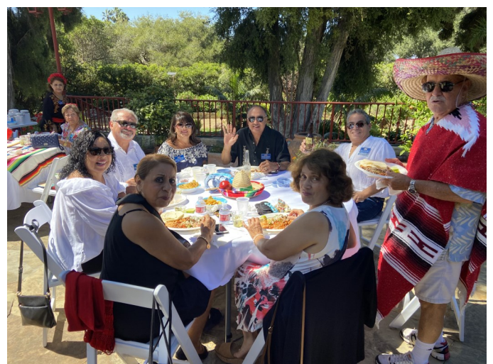
Members enjoying a tasty Mexican dinner