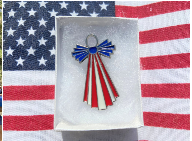
Angle pin presented to veterans