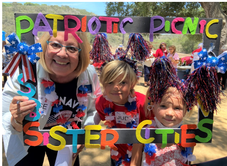
Judges of Patriotic Attire