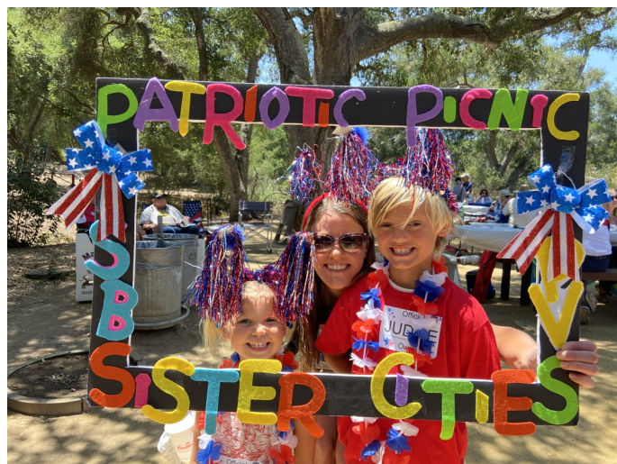
Mom and presentation performers