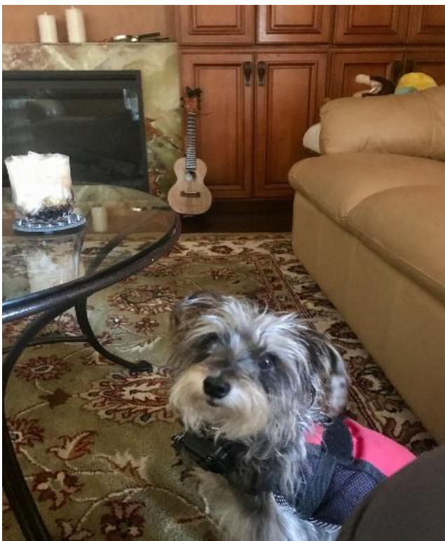
I have been teaching my 7 year old niece, walking my dog and learning the ukulele.. Oh yes, also studying mixology. Today I fixed myself a White Russian. Stay safe and hope to see you all soon.