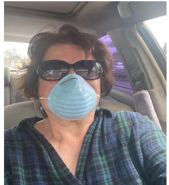
Staying safe in San Diego. Can't wait 'till I can travel to SB Nena Hidalgo