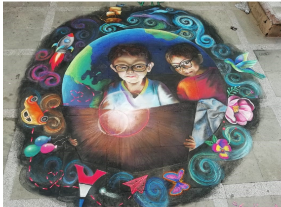
Chalk drawing of her children from 1918