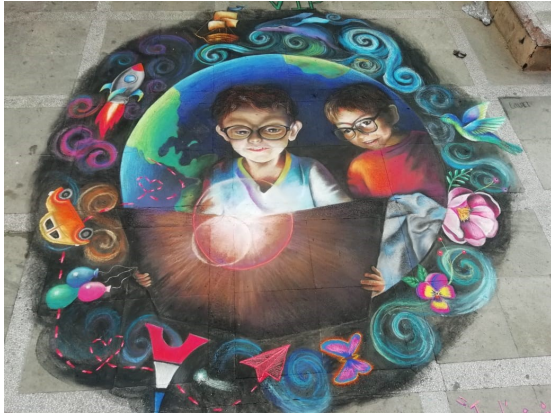
Chalk drawing of her children from 1918